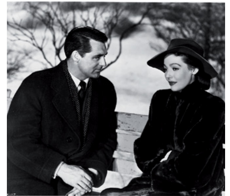
Cary Grant and Loretta Young in The Bishop's Wife (1947)

My personal favorite of all Christmas movies. David Niven is the bishop who neglects his devoted wife, Julia (Loretta Young), as he struggles to raise money to build a cathedral to satisfy the wish of a wealthy parishioner. He prays for guidance which appears in the form of an angel (Cary Grant), who finds himself falling for Julia and plays off the bishop's jealousy to accomplish his angelic task. Excellent supporting performances by Gladys Cooper as the dowager and Monty Wooley as an aging professor, and a memorable Hugo Friedhofer score combine to make this a Christmas movie to treasure.