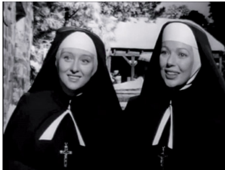
Celeste Holm and Loretta Young in Come to the Stable (1949)

Two nuns from a French convent (Loretta Young and Celeste Holm) travel to a New England town named Bethlehem to uphold a promise they made to St. Jude during the Second World War to build a hospital for sick children. Obstacles get in the way, especially to acquiring land owned by a Broadway songwriter (Hugh Marlowe) who does not want a children's hospital in his back yard. An unconscious wartime connection between his music and the origin of the nuns' plainchant leads him to rethink his opposition to the hospital.